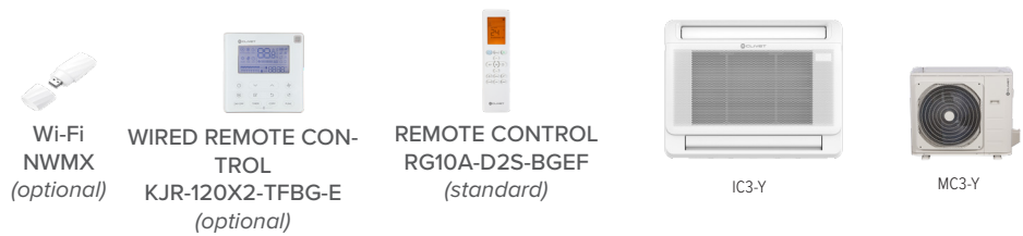
Wi-Fi NWMX (optional)